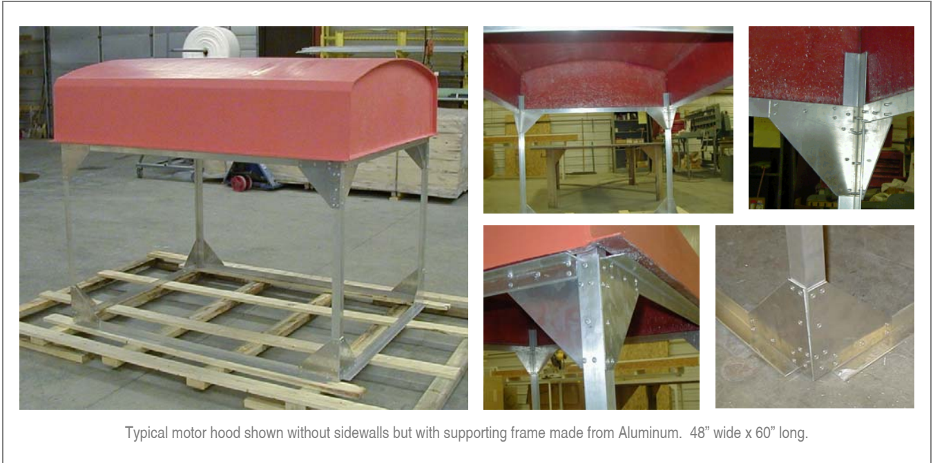
Typical motor hood shown without sidewalls but with supporting frame made from Aluminum. 48" wide x 60" long.

Worthington's motor enclosures are constructed of durable chemically resistant fiberglass and are custom fabricated to your exact requirements.